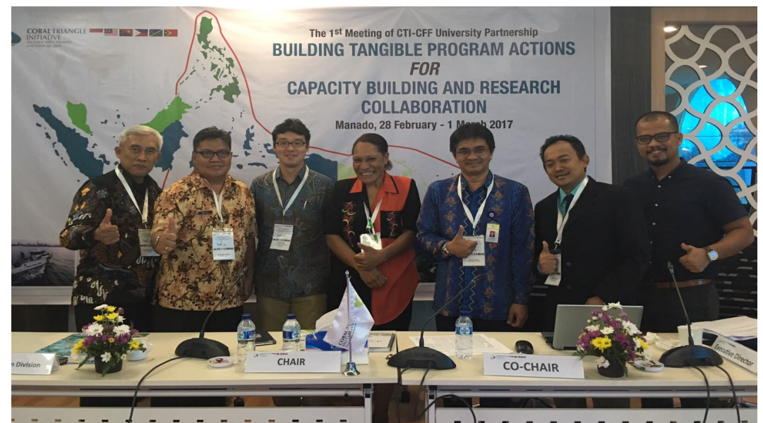
Figure 4. The Group C, tasked to discuss the Potential Collaboration and Support on Outreach Programs