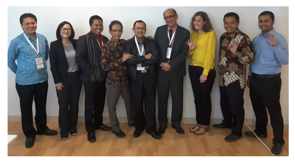
Figure 3. The Group A, tasked to discuss the Potential Collaboration and Support on Capacity Building

The proposed programs/actions on capacity building include academic collaboration and regional training. The academic collaboration will be focused on establishment of an international M.Sc. Subject on Coral Triangle Ecosystem Governance, and special assistance program for Timor-Leste in developing fisheries and marine sciences education. While, the regional training program will focus on the public engagement for Coral Triangle, and program and project management for Coral Triangle.