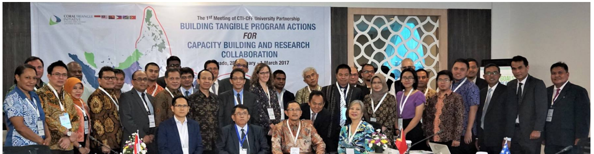
Figure 2. Group Photo of the 1<sup>st</sup> Meeting of CTI-CFF University Partnership

The CTI-CFF Regional Secretariat hosted the 1<sup>st</sup> Meeting of CTI-CFF University Partnership, hereinafter referred to as the "Meeting", on 28 February – 1 March 2017 at the CTI-CFF Headquarters in Manado, Indonesia. Delegates from the National Coordinating Committees (NCCs) of CTI-CFF Member States, representatives from Member of CTI-CFF University Partnership and observers attended the Meeting. The full list of participants is attached as in Annex I .